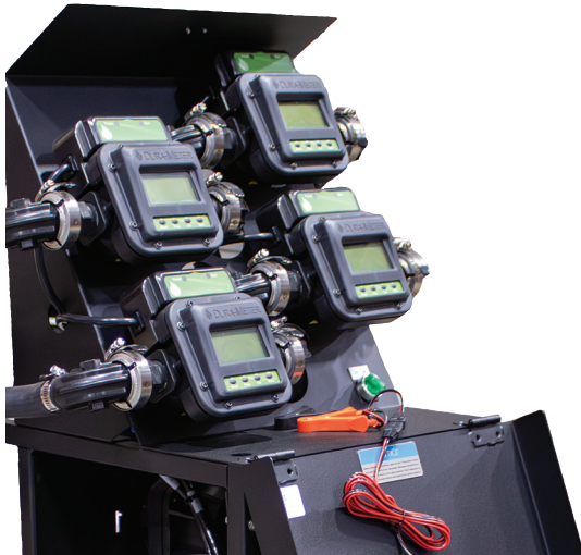
Built-in Shelf Under Meters