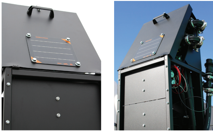
Protective Meter Lid & Solar Panel